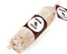
Salami with Chianti Wine SL004 gr. 500