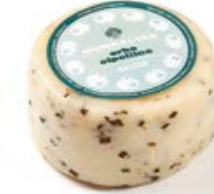
Monna Lisa with Chives ML045 gr. 500