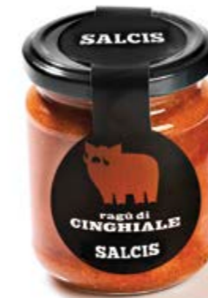
Wildboar ragù RC003 gr. 180