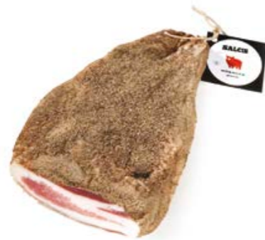
Cheek With Pepper GC001 Kg. 1,5