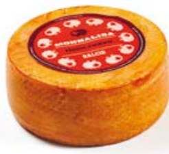
Red Monna Lisa ML002 Kg. 1,4