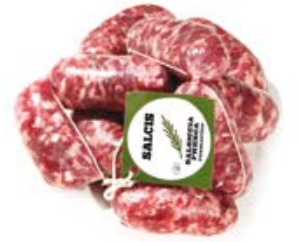
Fresh Sausages with rosemary SF003