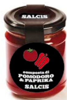
Tomatoes & paprika jam C021 gr. 200 C021P gr. 40