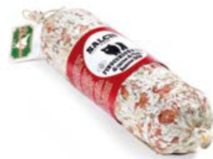
Finocchiona P.G.I. Cinta Senese CSF07 gr. 500