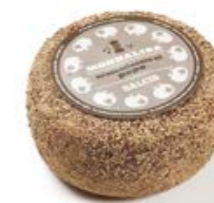
Spiced with Pepper ML053 gr. 500