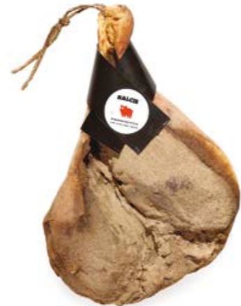
Sgambato PR003 Kg. 6