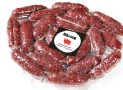
Stewed Sausages vacuum SMV01 Kg. 1