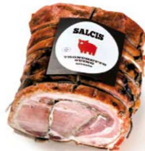
Roasted Pig's "Tronchetto" TR001 Kg. 14