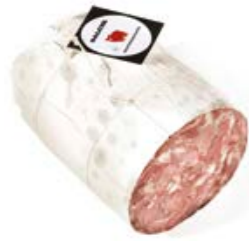
Soppressata in carta SP01 Kg. 5 / 6