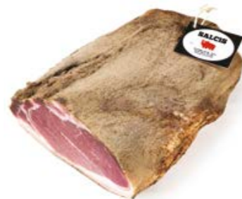
Aged Shoulder MEAT SS002 Kg. 1,5