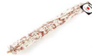
Sweet long salami SMD02 gr. 500