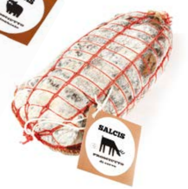
Boneless Venison Ham CVS02 Kg. 2