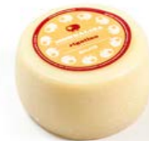
Monnalisa Rigatino ML007 gr. 500