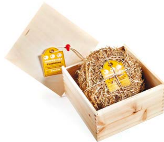
Monna Lisa "Trebhone" ML088 Kg. 2,6