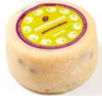
Monna Lisa Pistacchio ML047 gr. 500