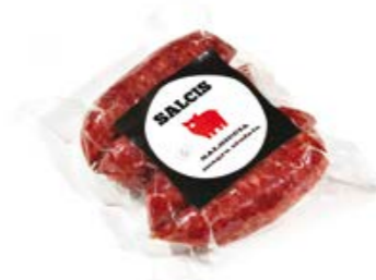
Stewed Sausages 4 pieces in vacuum SMB01