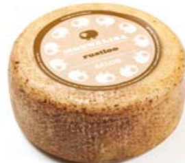
Rustico Monna Lisa ML008 Kg. 1,8