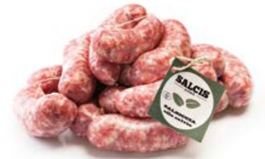
Fresh sausages with sage SF006