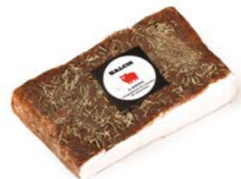
Aged Lardo LD001 Kg. 2,5 LDT01 Lardo Chunk Kg. 0,4