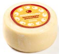
Monna Lisa pecorino cheese ML001 Kg. 1,5