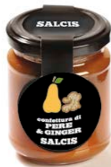
Pears & ginger jam C018 gr. 200 C018P gr. 40