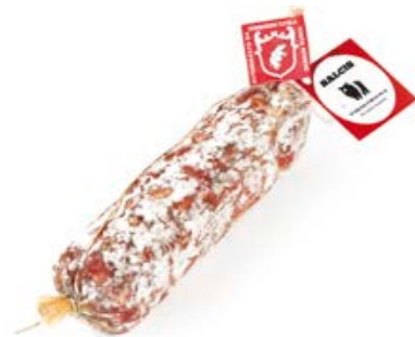
Cinta Senese "Briciolona" CS007 gr. 500