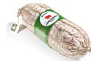
Finocchiona P.G.I. FN001 Kg. 2,5