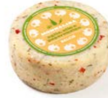
Monna Lisa Aglio, Olio e Peperoncino ML040gr. 500