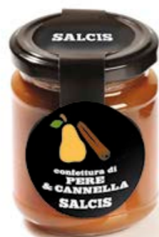
Pears & cinnamon jam C016 gr. 200 C016P gr. 40