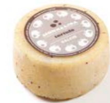
Monna Lisa with Truffle ML043 gr. 500