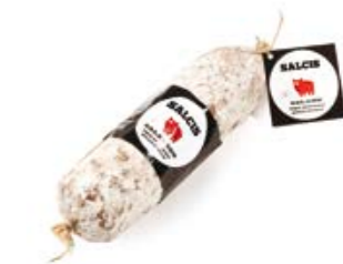
Tuscan Salami SL003 gr. 500