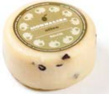
Monna Lisa with Olives ML046 gr. 500