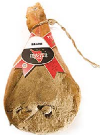
Ham P.D.O. PR001 con osso Kg. 9