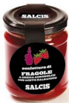
Strawberry & sweet balsamic cream jam C017 gr. 200 C017P gr. 40