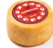
Monnalisa Red Rigatino ML039 gr. 500