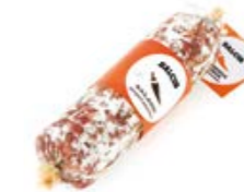
Salami with Chili SL006 gr. 500