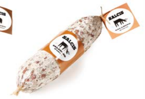
Venison Salami CV001 gr. 500