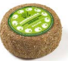
Spiced with Pot Herbs ML055 gr. 500