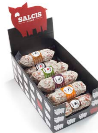
Salamini Mignon gr. 200 FNM01 Briciolona with fennel SLM03 Tuscan Salami SLM04 with Chianti Wine SLM05 With Truffle SLM06 with Chili SLM09 with 4 Pepper berry CSM02 Cinta Senese CVM01 Venison CGM02 Wildboar