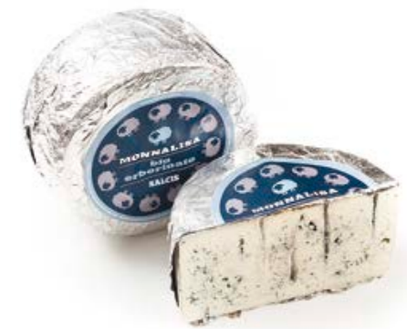
Monna Lisa Blue Cheese ML051 Kg. 3