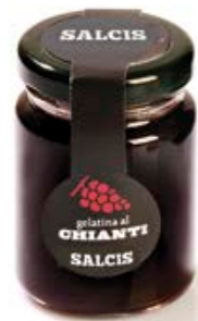
Chianti jelly GCH01 gr. 110