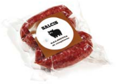
Wild Boar Sausages 4 pieces in vacuum sealed CGB01