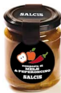
Apple & chilli jam C020 gr. 200 C020P gr. 40