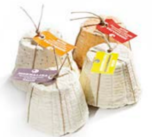
Natural Aged Ricotta RST01 Chilli Aged Ricotta RST02 Truffle Aged Ricotta RST03 Garlic, Oil & Chilli Aged Ricotta RST04