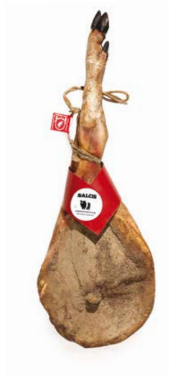
Boneless Cinta Senese Ham CS001 Kg. 7