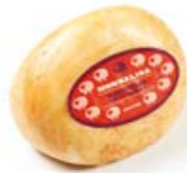
Red Marzolino Monna Lisa c11 ML004 Kg. 1