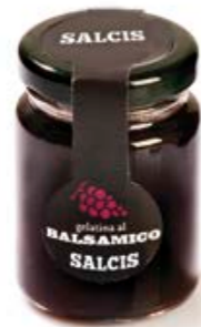
Balsamic jelly GAB01 gr. 110