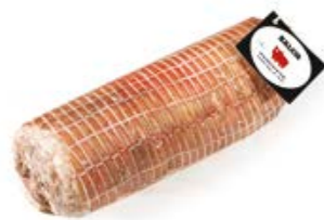
Cooked Pancetta PC001 Kg. 2 / 2,5