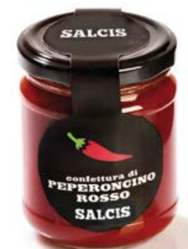
Chilli jam C013 gr. 200 C013P gr. 40