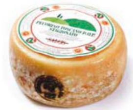
Aged Pecorino P.D.O. DP02 Kg. 2