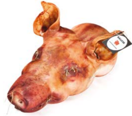
Stuffed Pig's Head TS001 Kg. 10 / 12