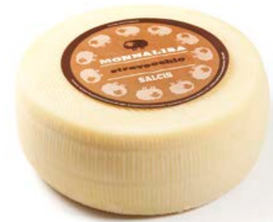
Monna Lisa "Stravecchio" ML085 Kg. 7