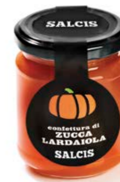
Pumpkin jam C008 gr. 200 C008P gr. 40