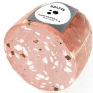
Mortadella with truffle MTC01 Kg. 5 MT001 Kg. 2,2