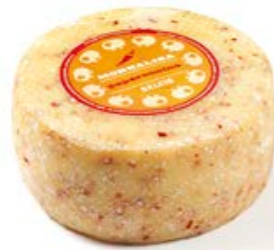
Monna Lisa with Chili ML042 Kg. 1,5