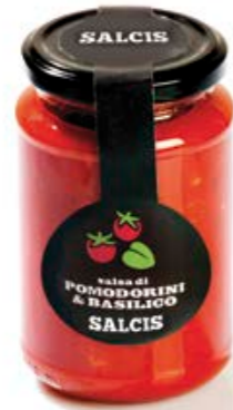
Tomatoes and basil sauce PM002 gr. 340