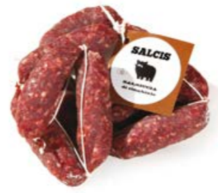
Wild Boar Sausages CG001