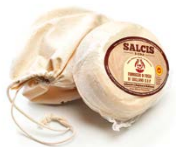
Monna Lisa Pit Aged cheese ML084 Kg. 1,2