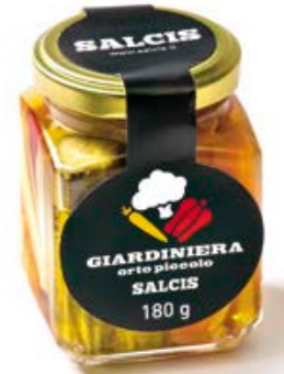
Marinated mixed pickled vegetable S008 gr. 180