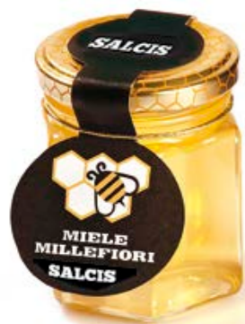
Honey MEM01 gr. 200 MEMP1 gr. 40