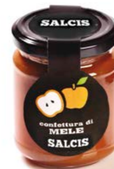
Apple jam C005 gr. 200 C005P gr. 40