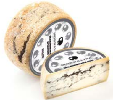
Marmorizzato with Truffle Cheese ML090 Kg. 2,6