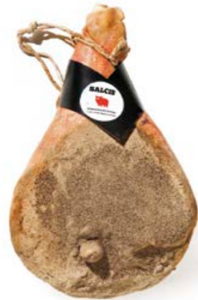
Ham "SIENA" PR002 con osso Kg. 9