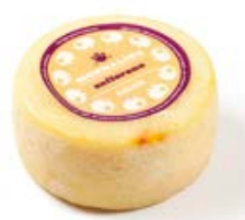
Monna Lisa with Saffron ML044 gr. 500