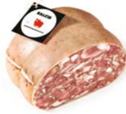
Soppressata in cotenna SP02 Kg. 8