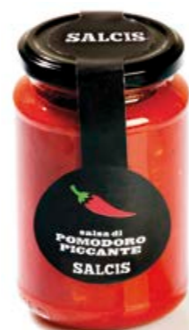
Chilli tomatoes sauce PM003 gr. 340