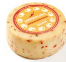
Monna Lisa with Chili MLP42 gr. 500