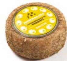
Spiced with Capers ML054 gr. 500