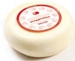
Monna Lisa "Maggiolino" ML006 Kg. 1,3