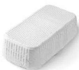
Fresh Monna Lisa FML1 Kg. 2