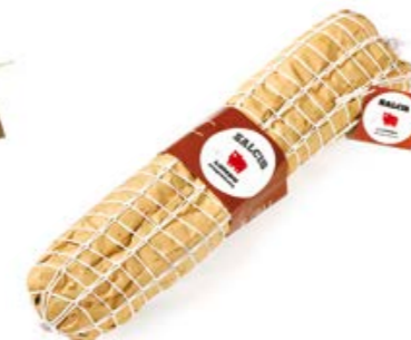
Aged Lombo LB001 Kg. 2,6 Aged Lombo chunk Kg. 0,4 LBT01