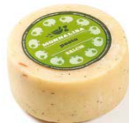
Monna Lisa with Pesto ML049 Kg. 1