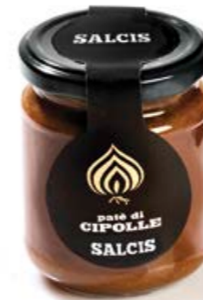
Onion pâté P006 gr. 180