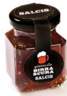
Brown beer jelly GBS01 gr. 100