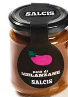
Aubergine pâté P005 gr. 180