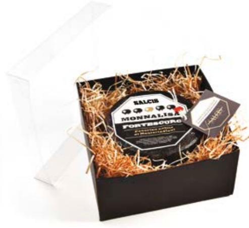
Monna Lisa "Fortescuro" ML089 Kg. 2,6