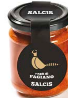
Pheasant ragù RC006 gr. 180