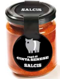
Cinta senese ragù RC007 gr. 180