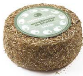
Monna Lisa cave Aged Cheese ML087 Kg. 2,6