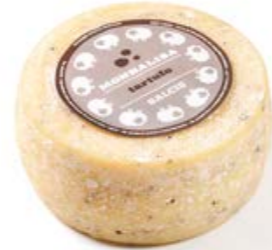
Monna Lisa with Truffle MLT43 Kg. 1