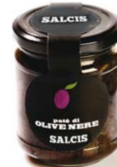
Orages & black olives pâté P008 gr. 180