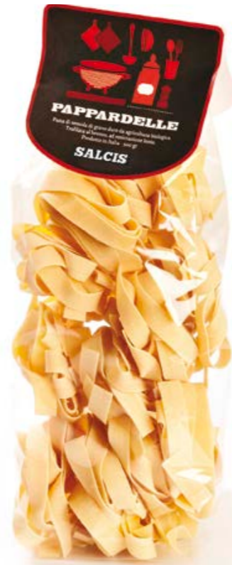
Pappardelle PS02 gr. 500