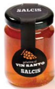
Vinsanto sweet wine jelly GVS01 gr. 110