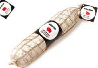
Tuscan Salami SL002 Kg. 1