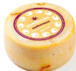
Monna Lisa with Saffron MLG44 Kg. 1