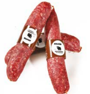
Wild Boar Small Salami CG003 gr. 500