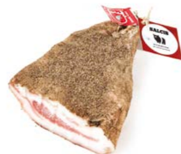
Cinta Senese Cheek CS008 Kg. 1