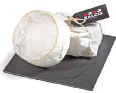
Monna Lisa Fiorita ML058 Kg.0,5 MLG58 Kg.1