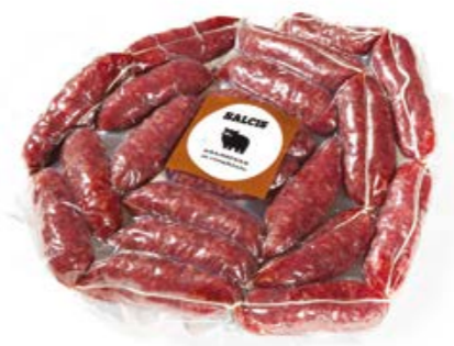
Wild Boar Sausages Vacuum Sealed CGV01 Kg. 1