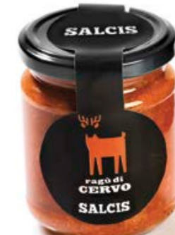
Venison ragù RC001 gr. 180