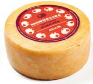
Monna Lisa red "Gigante" ML010 Kg. 3