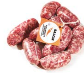
Fresh Sausages with chilli SF002