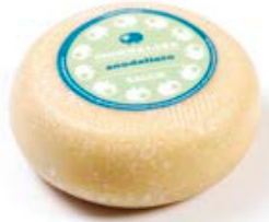
Monna Lisa Scodellato ML005 Kg. 1,3