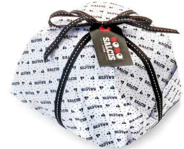
Sweet bread with pears & black pepper berry LPP01