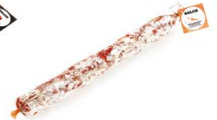
Spicy Long Salami SMP02 gr. 500