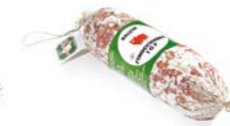
Finocchiona P.G.I. FN002 gr. 500