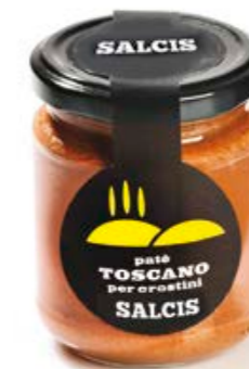
Tuscan pâté P004 gr. 180