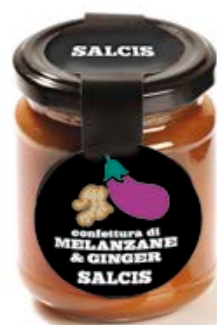
Aubergine & ginger jam C019 gr. 200 C019P gr. 40