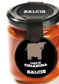
Chianina ragù RC008 gr. 180