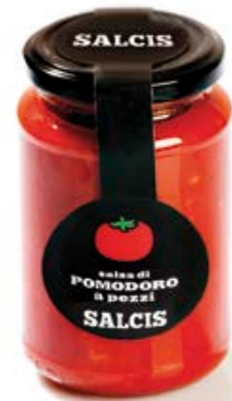
Tomatoes sauce in pieces PM001 gr. 340