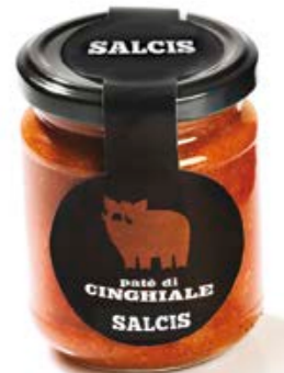
Wildboar pâté P003 gr. 180