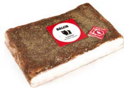
Cinta senese "lardo" CS006 Kg. 2,5