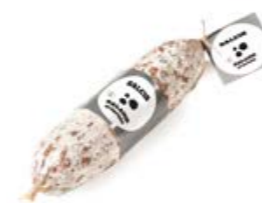
Salami With Truffle SSL005 gr. 500