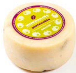
Monna Lisa with pistachio nut MLG47 Kg. 1