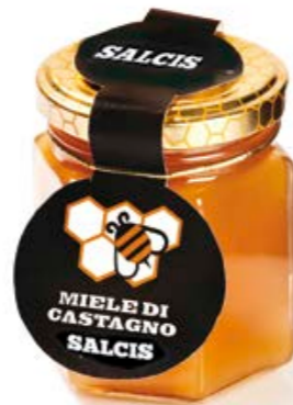
Chestnut Honey MEC01 gr. 200 MECP1 gr. 40