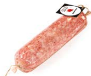
cooked Salami ST001 Kg. 0,6