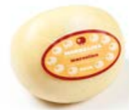
Marzolino Monna Lisa ML003 Kg. 1