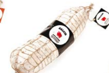
Tuscan Salami SL001 Kg. 2,5