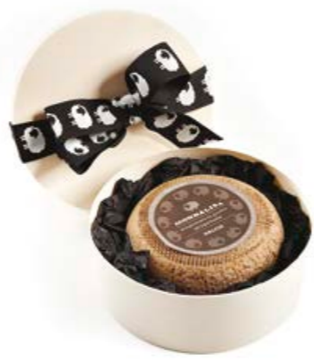
Monna Lisa with truffle aged in Cave MLG43 confezione regalo Kg. 1