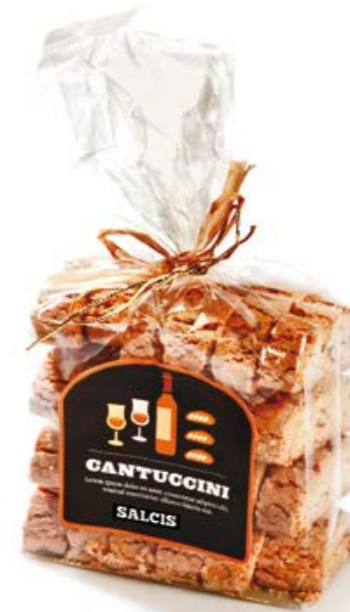
Cantuccini B001 gr. 300