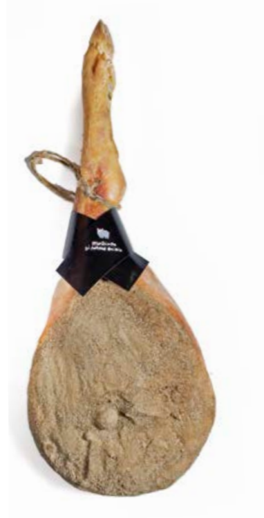
Grey Pork Ham PR099 Kg. 7