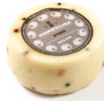
Monna Lisa with Pepper MLP41 gr. 500