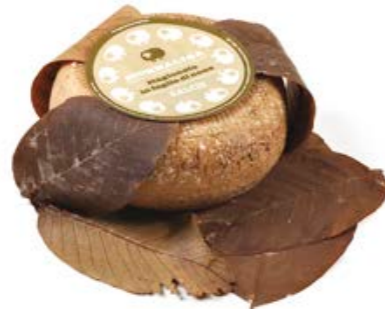
Monna Lisa aged with walnut leaves ML082 Kg. 1,2