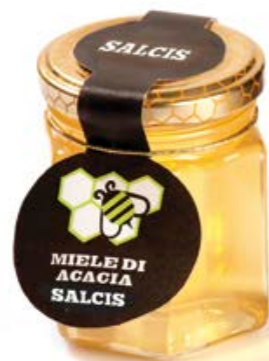
Acacia Honey MEA01 gr. 200 MEAP1 gr. 40