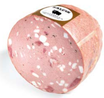
Mortadella With Boar Meat MC001 Kg. 3,5