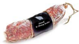
Grey Pork Salami SL099 gr. 500