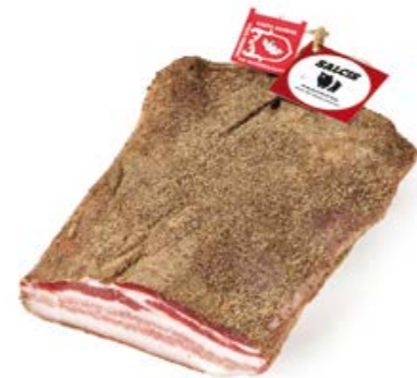
Cinta Senese Flat Pancetta CS004 Kg. 2