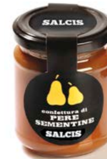
Pears jam C001 gr. 200 C001P gr. 40