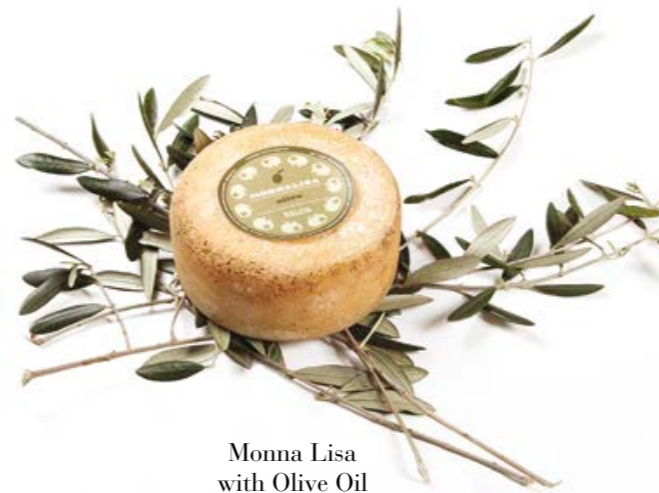
Monna Lisa with Olive Oil ML050 Kg. 1