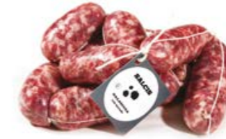
Fresh Sausages with truffle SF005