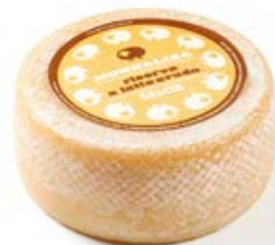
Monna Lisa reserve raw milk ML083 Kg. 1,5