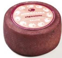
Monna Lisa "Vignaiolo" ML081 Kg. 1,5