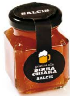
Blonde beer jelly GBC01 gr. 100