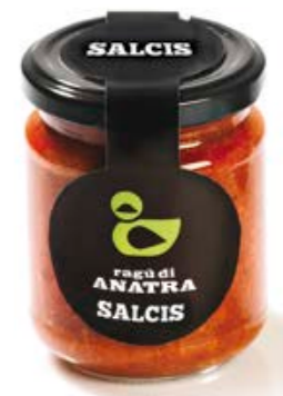
Duck ragù RC002 gr. 180