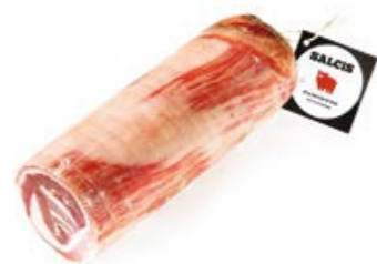
Rolled Pancetta PA001 Kg. 3,5