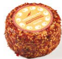
Spiced with Chili ML052 gr. 500