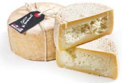
Fogliano Cheese FG001 Kg. 1,2