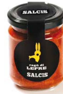
Hare ragù RC005 gr. 180