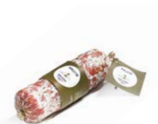
Salami with 4 Pepper berry SL009 gr. 500