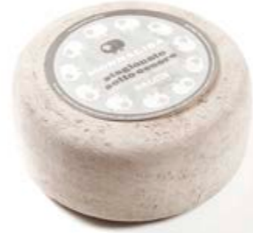
Monna Lisa covered in ash ML086 Kg. 1,5