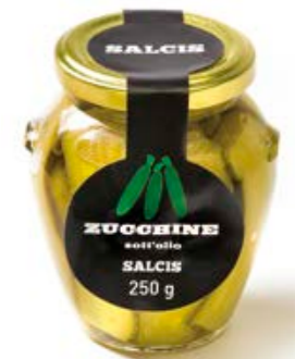
Marinated zucchini S007 gr. 250