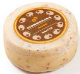
Monna Lisa with walnuts ML048 Kg. 1