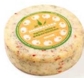
Monna Lisa with Garlic, Oil & Chilli MLG40 Kg. 1