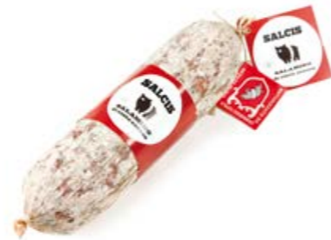
Cinta Senese Salami CS002 gr. 500