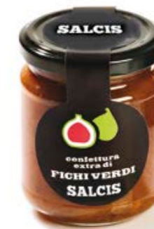
Figs jam C003 gr. 200 C003P gr. 40