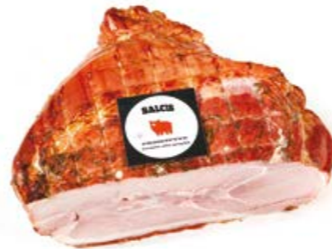
Baked Ham PG001 Kg. 6