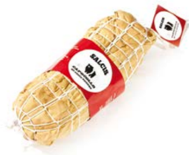
Cinta Senese Capocollo CS005 Kg. 1,5