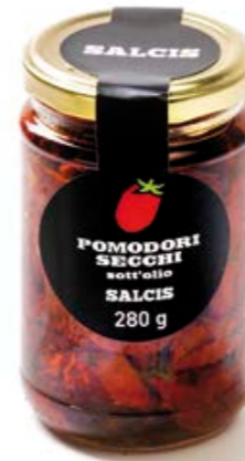
Marinated dry tomatoes S002 gr. 280