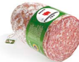
Finocchiona P.G.I. FN003 Kg. 8