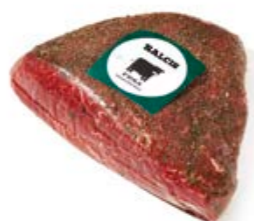
Marinated Rump CH001 Kg. 2