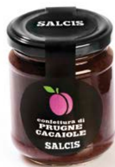
Onion jam C015 gr. 200 C015P gr. 40