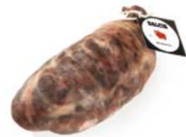
Buristo BR001 Kg. 2