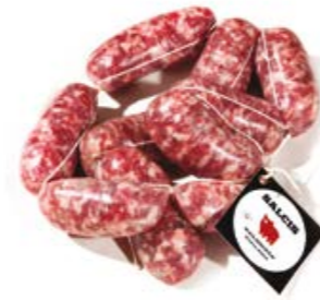
Natural Sienise Fresh Sausages SF001