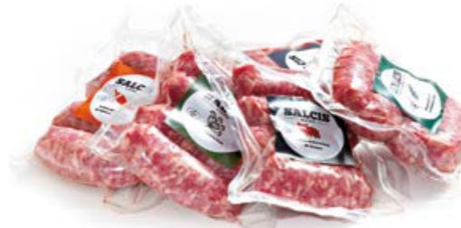
Fresh sausages 4 piece in vacuum Natural SFB01 Chilli SFB02 Rosemary SFB03 Fennel SFB04 Truffle SFB05 Sage SFB06