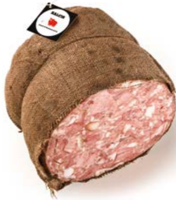
Soppressata gigante in juta natural SP003 Kg. 16 Soppressata gigante in juta with truffle SP004 Kg. 16 Soppressata gigante in juta with parsley SP005 Kg. 16 Soppressata gigante in juta with chilli SP006 Kg. 16