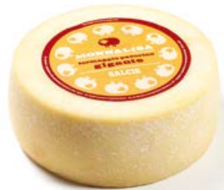
Monna Lisa "Gigante" ML009 Kg. 3