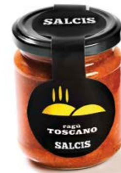
Tuscan ragù RC004 gr. 180