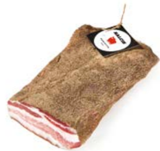
Fat Pancetta PT001 Kg. 2,5 Smoked Flat Pancetta PT002 Kg. 2,5