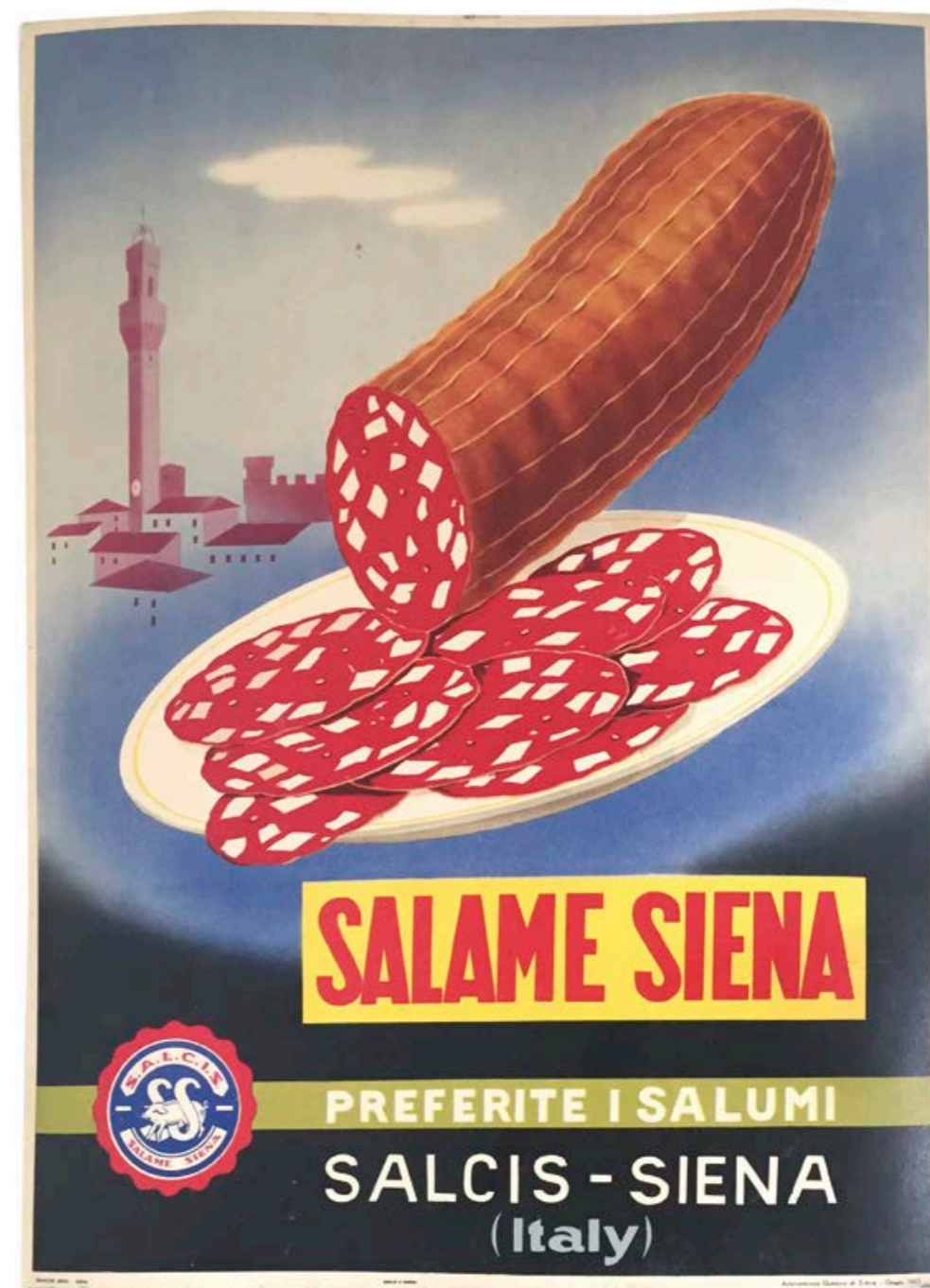
Pubblicità originale Salcis degli anni '60