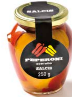
Marinated pepper S003 gr. 250