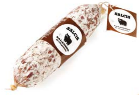
Wild Boar Salami CG002 gr. 500