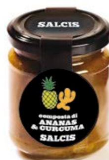
Pineapple & turmeric jam C022 gr. 200 C022P gr. 40