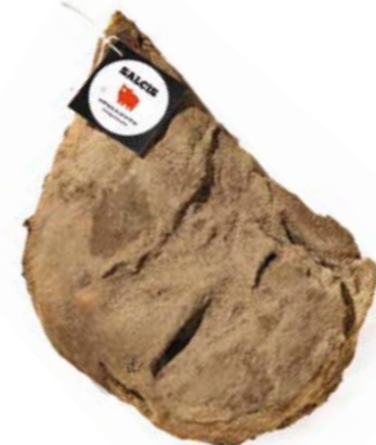
Aged Shoulder SS001 Kg. 2,5