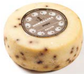
Monna Lisa with Pepper ML041 Kg. 1,5