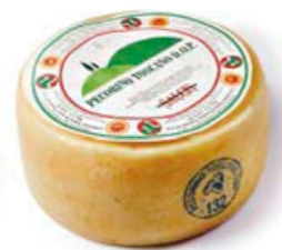
Soft Pecorino P.D.O. DP01 Kg. 2