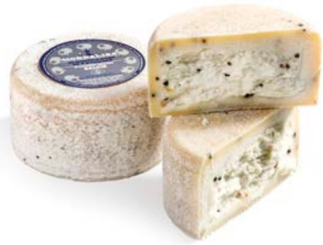
Pecorino "Four peppers" ML038 Kg. 1,5 MLP38 Kg. 0,5