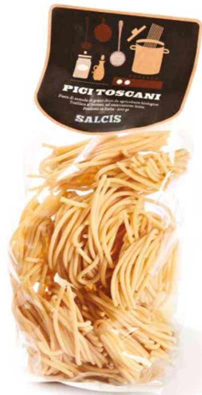
Pici PS01 gr. 500