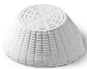
Ricotta R001 Kg.1,7 Small Ricotta R002 gr. 400