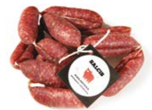
Stewed Sausages SM001