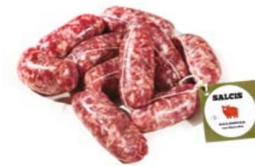
Fresh Sausages with fennel SF004