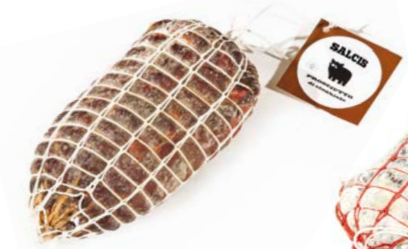
Boneless Wild Boar Ham Kg. 2