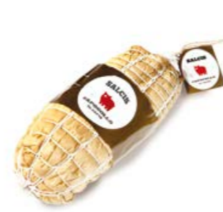
Wrapped by Yellow Paper Capocollo CP001 Kg. 2